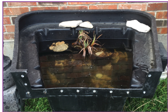
Figure 3. Drain or treat all standing water to prevent mosquito breeding around your home.

Insect repellents are much less likely to harm adults or children than are Zika or other mosquito-borne diseases such as West Nile virus.