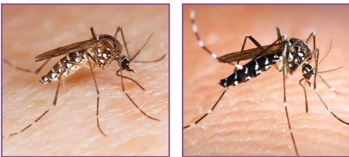
Figure 1. The yellow fever mosquito (left) and Asian tiger mosquito (right) are carriers of the Zika virus.

The most common way to contract Zika virus is from the bite of an infected mosquito. Two species of mosquitoes (Fig.1) spread the virus to people: the yellow fever mosquito ( Aedes aegypti ) and the Asian tiger mosquito ( Aedes albopictus ). Both are native to Texas.