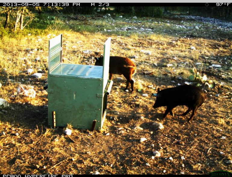
Species specific delivery systems such as this one are designed to allow wild pigs to access baits without allowing access to non-targeted species.

Another significant challenge to remotely administered wild pig fertility control is species specific delivery. The drug would need to be encapsulated or otherwise provided in such a way that it is not only bait stable and palatable, but also accessible to only wild pigs. Researchers have already been working for many years to develop this exact type of system in order to deliver toxicants such as sodium nitrite to wild pigs. A number of different designs for wild pig specific baiting systems have been devised that utilize animal recognition software, roter gates and various types of weighted doors. However, non-targeted species including raccoons and especially black bears have proven persistent in their ability to access baits intended only for wild pigs. Another compounding factor is that feral