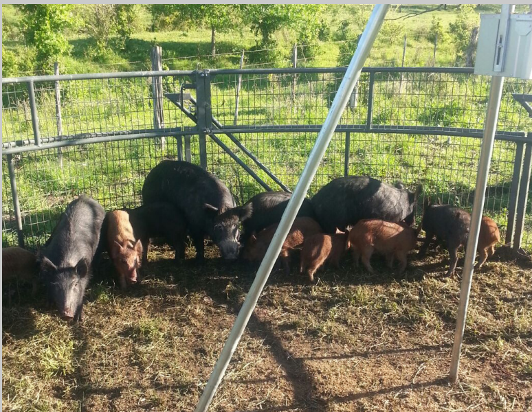
Available county funding can be matched by participating landowners in order to purchase emerging technologies such as remote and suspended trapping systems.

Cooperative land management efforts are increasing in popularity across Texas, and one alternative is the creation of a landowner cooperative (co-op) abatement program. Wildlife management co-ops allow for collective management plans, where relatively large tracts of land can be actively managed through the pooling of resources and effort. These same principles can be applied through a targeted wild pig abatement co-op. Landowners who are interested may enter the program by paying a small fee, usually on a per acre basis. This fee can then be matched by the county through various funding sources. By requiring landowners to match the funding that the county is putting towards the program, the amount of resources available to the program essentially doubles. The money then goes into a targeted abatement effort, bringing aerial gunning, corral traps, box traps, the use of wireless/suspended trap technologies and other means of reducing the damages associated with wild pigs.