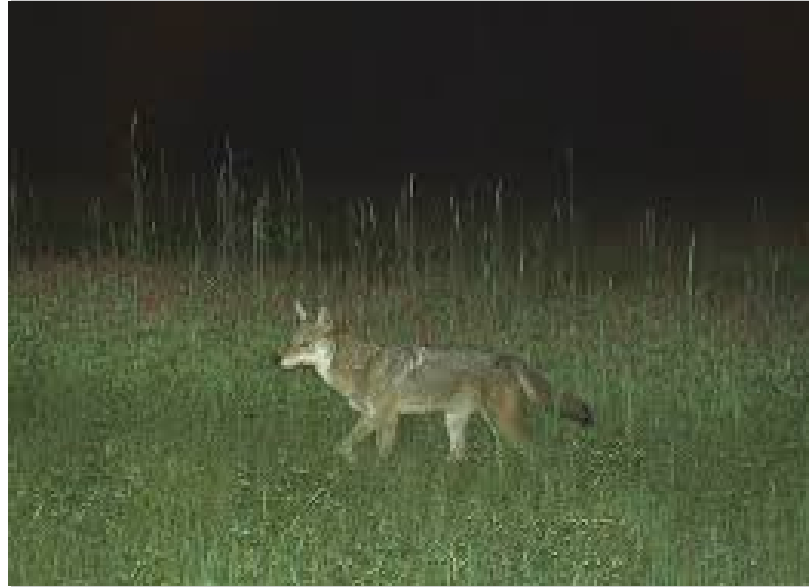
The potential for secondary transfer to wildlife species and/or surface water systems is another challenge to wild pig contraception.

swine are highly intelligent and adaptable animals, 10 and are capable of exhibiting aversion to man-made contraptions including box traps, corral traps, roter gates and increasingly even helicopters.