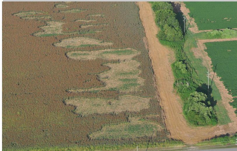
Adjacent landowners who participate together in cooperative wild pig abatement can increase the success of their efforts when enacting control methods such as trapping and aerial gunning.

Advantages of a county-based wild pig co-op can include increased landowner engagement, reduced numbers of wild pigs over a continuous area, long-term success through continuous control and others. When landowners contribute funds to the program, they are much more likely to be engaged, while also taking advantage of the available services and expertise for as little as fifty cents on the dollar. Encouraging neighbors to participate together in a program ensures large, continuous tracts of land can be impacted. While the upfront cost of a county purchasing head gates and materials to build corral traps can be somewhat expensive, the long-term benefits are significant and can potentially quickly offset the initial investment. For example, while a bounty program may last 1-3 months, traps can last decades with regular maintenance and good care. Additionally, funds invested into a co-op program continue to work for the county, whereas once bounty funds are distributed they no longer contribute towards future wild pig abatement.